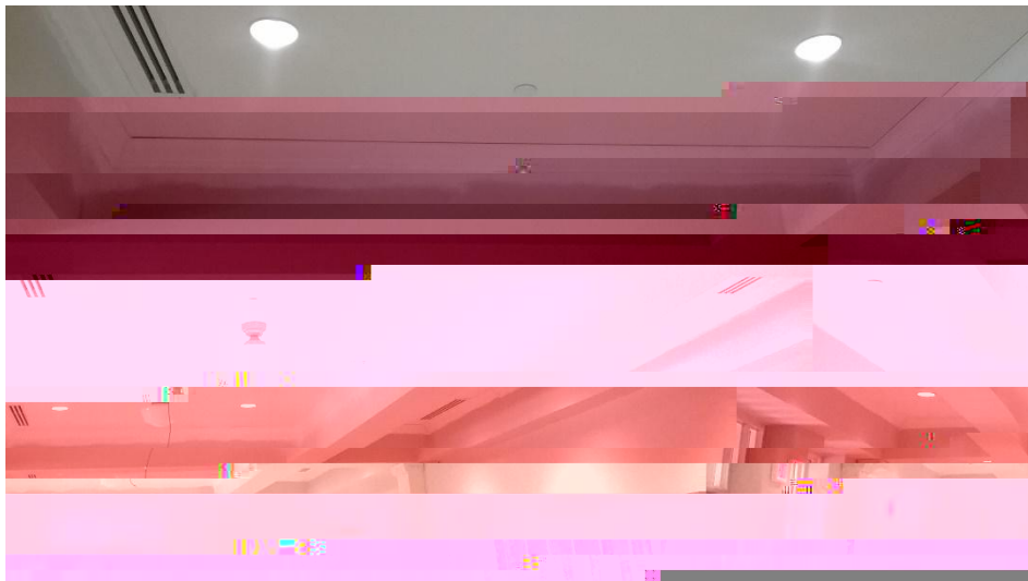
Main Entry Foyer ceiling prep work for paint continues